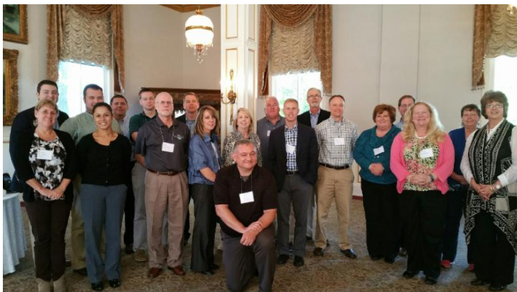
Successful DAO Meeting in Abingdon, VA 10-15-15