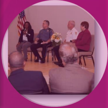
Chai & Chat