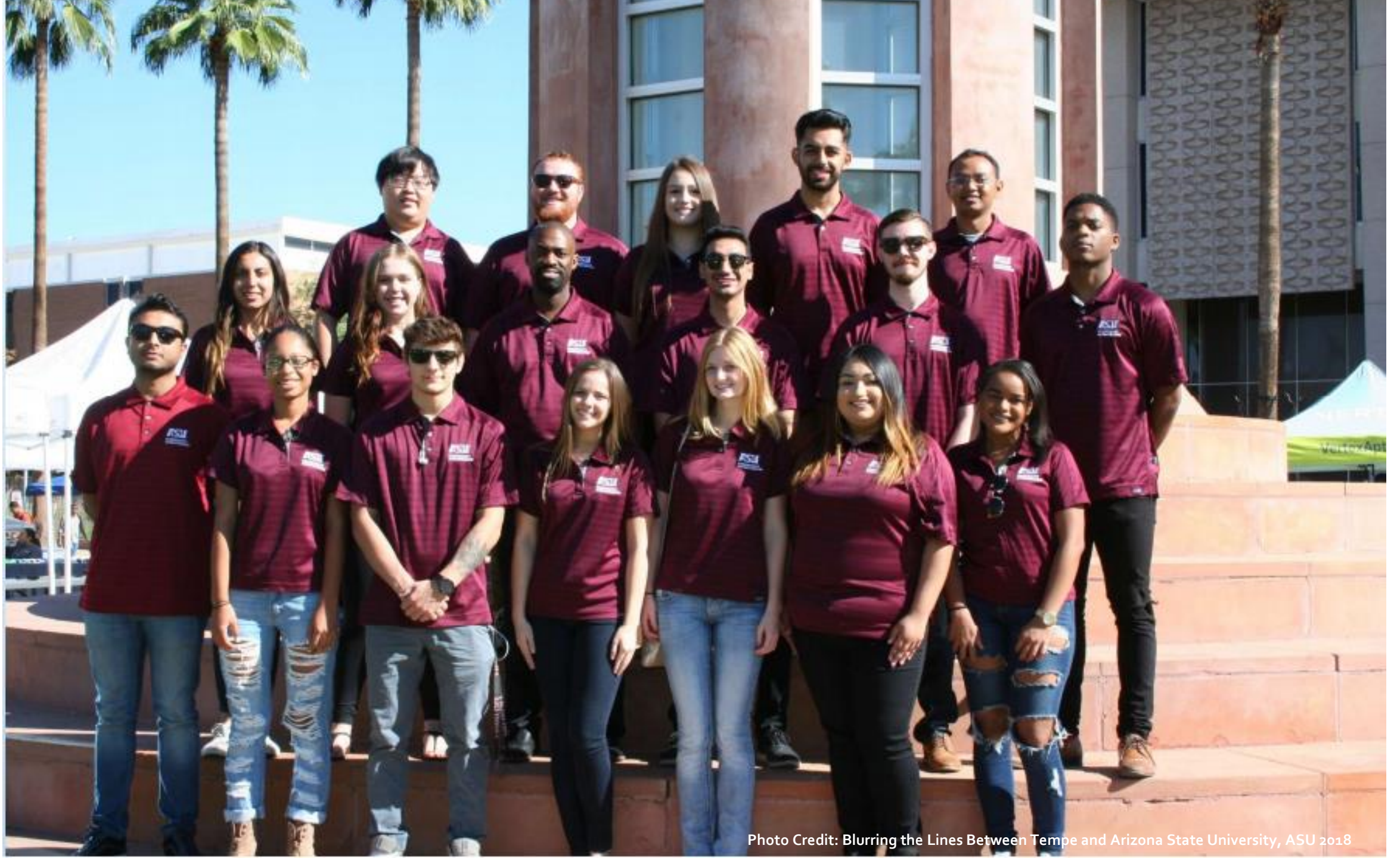
Photo Credit: Blurring the Lines Between Tempe and Arizona State University, ASU 2018