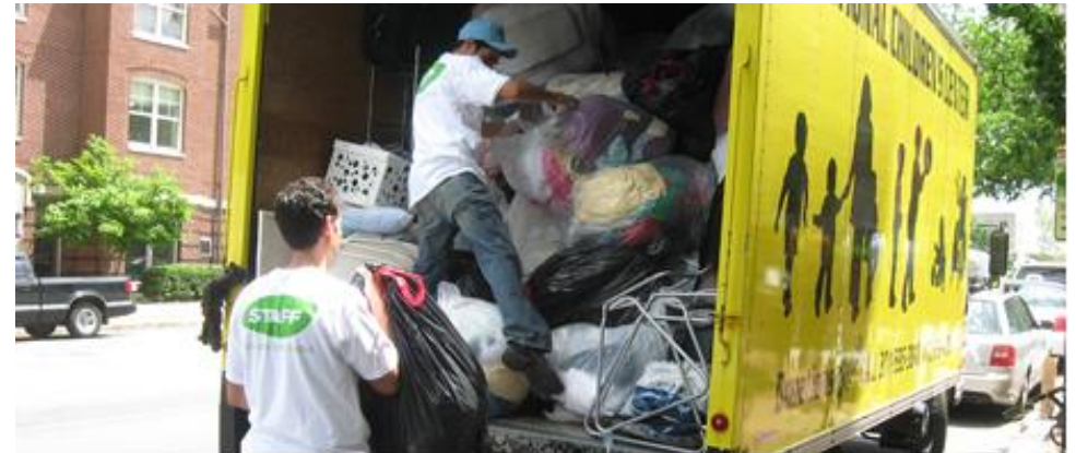
GW Today, George Washington University, 2015