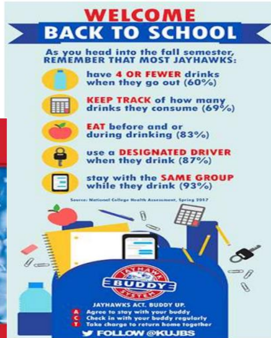
PROTECTIVE BEHAVIORS & SOCIAL NORMS CAMPAIGN, University of Kansas, 2018