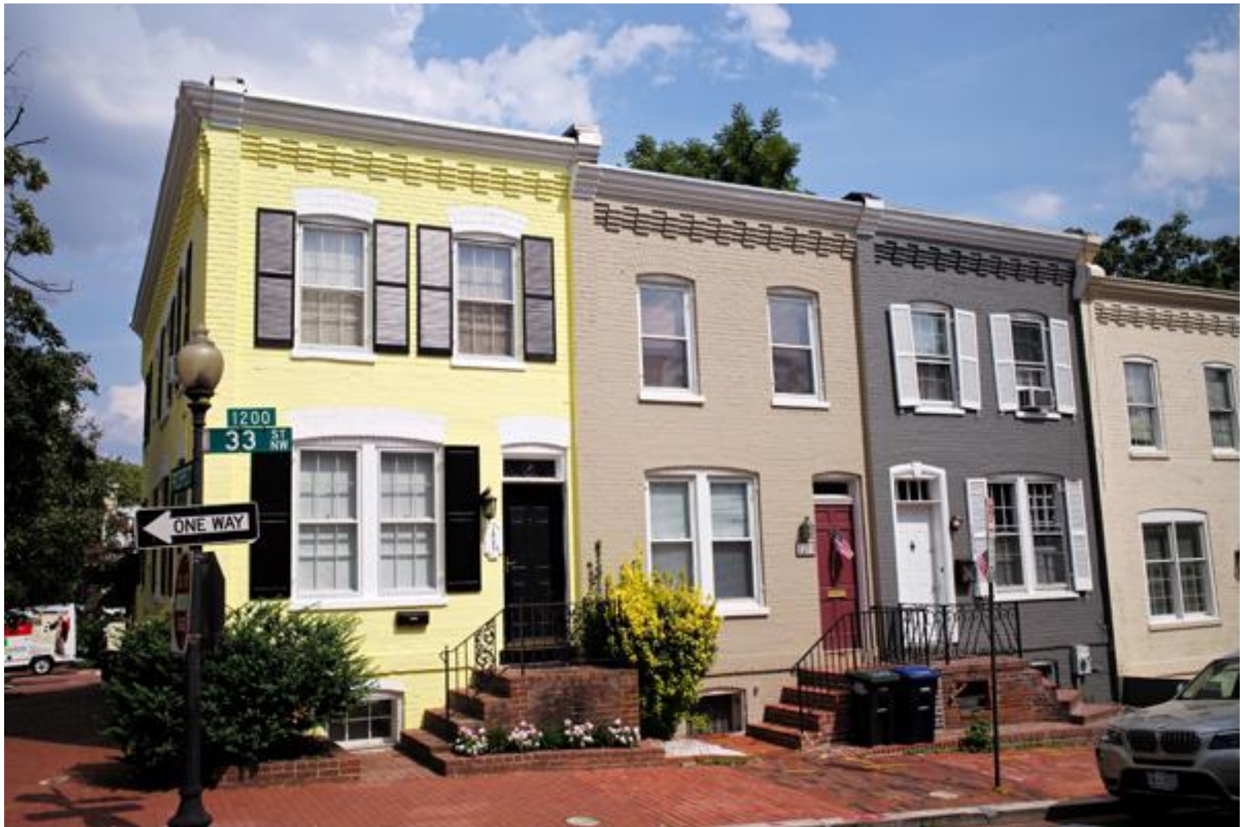
A Discussion of Best Practices for Town Gown Initiatives: How to Implement In Large-Scale and Small-Scale Communities, State College, PA, 2018