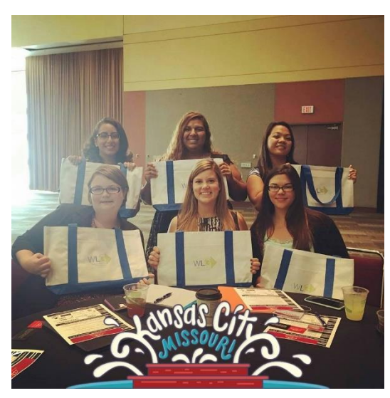
NIU MPA students who participated in the women's workshop at 2016 ICMA Conference in Kansas City, MO.

In addition, numerous chapter members attended the following events with many students receiving scholarships to attend: