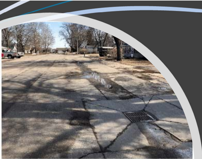
FIGURE C.1: TYPICAL STORM SEWER SYSTEM ALONG MAIN STREET (LOOKING EAST)