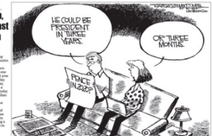
LETTERS TO THE EDITOR