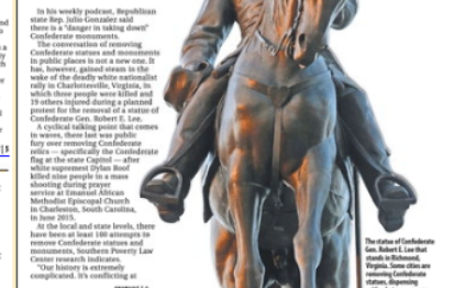
The statue of Confederate Gen. Robert E. Lee is a controversial symbol in many parts of the United States.