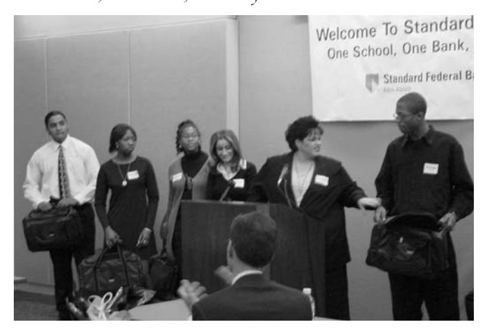
City of Oak Park (pop 29,793) Category: Community Partnerships One School, One Bank, One City

The One School, One Bank, One City program was created to enhance high school business programs, foster entrepreneurs within the city and create corporate career opportunities through partnerships. Under the leadership of Standard Federal Bank, an in-bank program was created where students learn about banking and business as well as the importance of client service. High school seniors are selected to participate in a coop program and are given the opportunity to work as a Teller from 20-25 hours per week. In addition to employment, the students attend informative sessions on the bank's internal processes of small business banking, retail banking and training, human resources, and diversity training. Students gain valuable training in how to create a resume, what to expect in a job interview as well as workplace ethics and expectations. The program also includes a number of career oriented site visits with external partners where students learn about career opportunities and educational requirements within each organization. In addition, students are assigned a bank mentor, and participate in the Detroit Children's