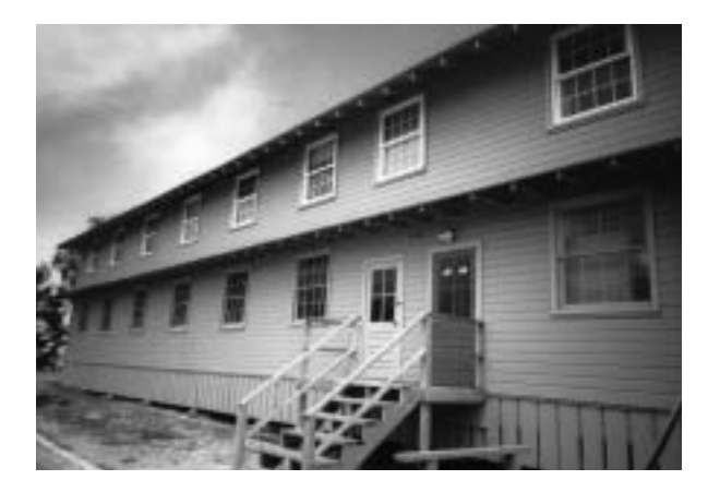
LBP encapsulation method