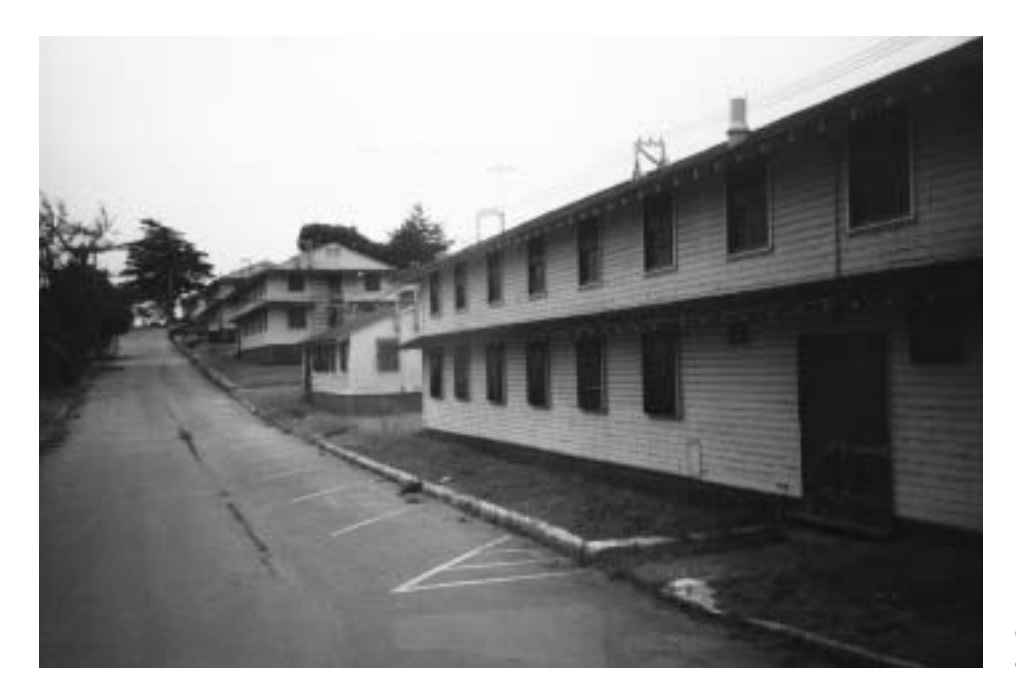
Rows of Army barracks contaminated with LBP and ACM