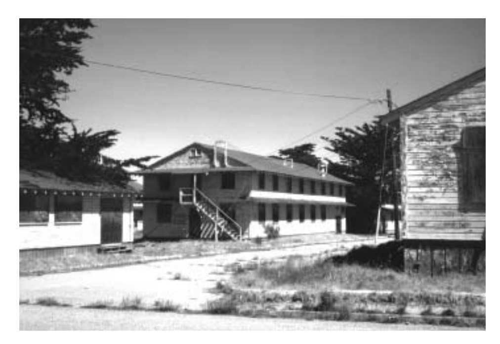
Army barracks with peeling LBP at the former Ft. Ord in Monterey, California

or conduct abatement prior to transferring the property or to require the transferee to conduct the abatement as a condition of sale. DoD or the transferee must conduct abatement or establish control measures within 12 months after the completion of the risk assessment. In the majority of cases, DoD prefers that "responsibility for control or abatement be transferred to the purchaser, in which case the service must ensure that abatement is conducted in accordance with Title X."<sup>42</sup> The transferee cannot occupy the site until all LBP abatement has been completed.