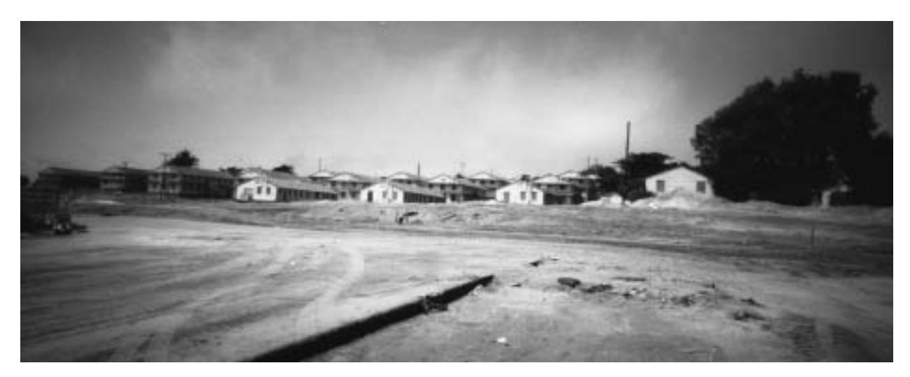
Building deconstruction and relocation cleared the way for the 12th Street Realignment

FORA's experience from 2000, in terms of the Hierarchy of Building Reuse priority number 2 (relocation and renovation), led to an adjustment in the Building Removal Program. Twenty-six buildings in the 12th Street Realignment corridor were offered to the general public for relocation and reuse, if hazards were abated and recipients bore all costs. As a result of the offering, the Marina Coast Water District attempted to relocate one building. Consumers found that the cost to relocate and meet current building codes precluded reuse of these structures as residences and offices, and that local house-moving firms were completely inundated with the construction boom of 1999. This experience and analysis suggested that no more than 5% of buildings on Fort Ord were salvageable by relocation.