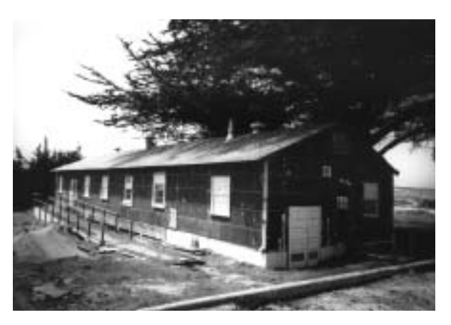
Demonstration for asbestos removal

• Profiling the building stock by type can aid in salvage and building removal projections