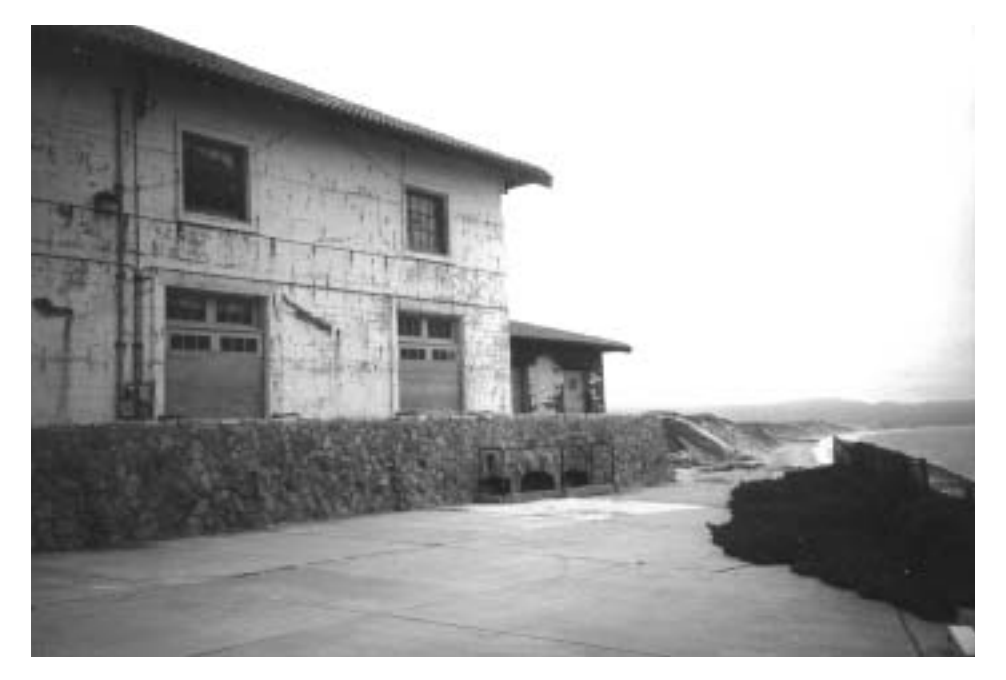
Deteriorating coastal facilities at the former Ft. Ord in Monterey, California

DoD policy requires abatement of ACM when the asbestos is considered a threat to human health and the structure containing the ACM is not scheduled for demolition. Under those conditions, abatement can be conducted by the service that used the structure (or entire base), a service disposal agency, or the transferee. If the transferee assumes responsibility for abatement, it is negotiated as part of the contract for sale.