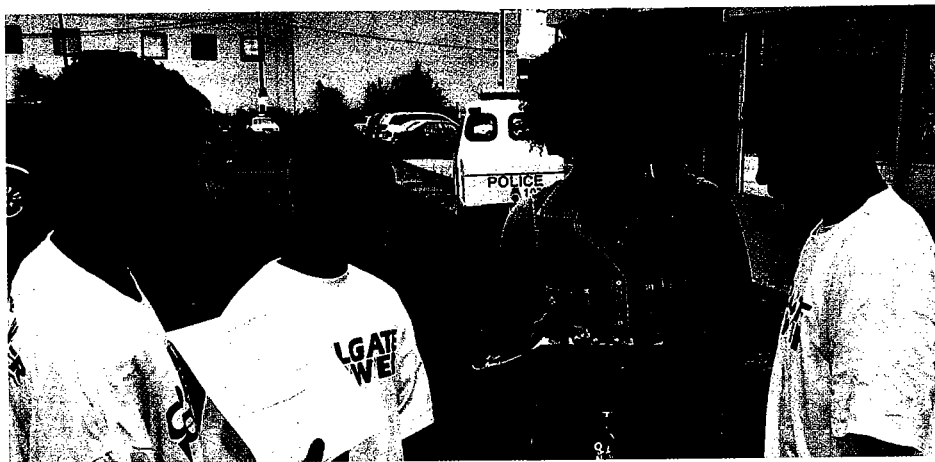
Young people take advantage of an opportunity to register to vote.