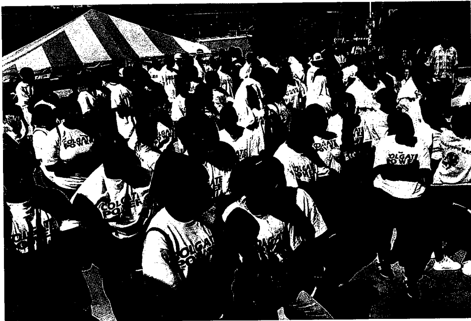
East Orange youth gather for a press conference and rally in support of the city's Youth 2000 Initiative Program, which supports employment and community involvement.