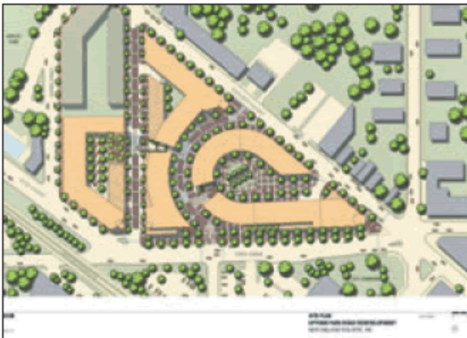
Figure 6. New England Builders' site plan for Park Ridge, Illinois, project.