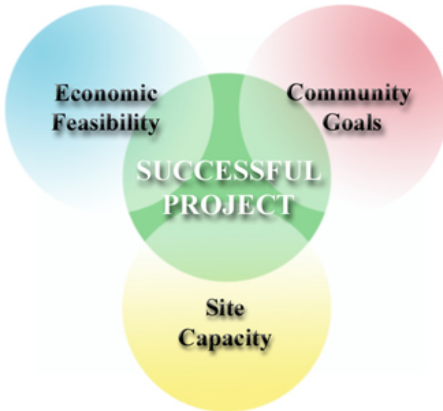
Figure 2. Mix of Crucial Factors For a Successful Development Project

Depending on the extent of prior planning, there may need to be extensive public participation in the process, to address such critical issues as height, orientation, parking, traffic, general design/materials, and community character. In some communities, open workshops or charrettes are held early in the process.