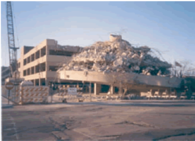
Figure 5. Deck demolition, Des Plaines, Illinois.