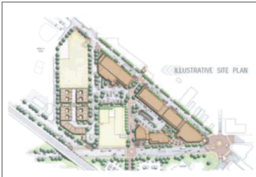
Figure 7. PRC by James/MidAmerica for Park Ridge project.

This is the time to put in requirements that reflect the local government's desire to steward the land and achieve key public goals. Some requirements and goals may affect the economics of the project and the value of the land. But if these effects are affordable and acceptable, the redevelopment agreement and the covenants that run with the land are the mechanisms with which to protect the land and public goals, and this must be done before transfer.