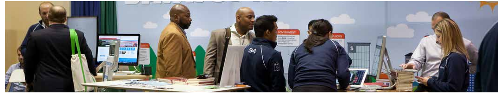
Exhibit at ICMA's 2016 Annual Conference!

SeeClickFix Senior Executive Institute University of Virginia Severn Trent Services Siemens SIGNiX SMG Convention, Sport & Entertainment Venue Management Social Sentinel, Inc. Socrata Standard & Poor's Ratings Services STAR Communities Stewart Signs Strategic Government Resources (SGR) SUEZ SunGard Public Sector SunShot Solar Outreach Partnership Swagit Productions, LLC TAG Communications Tanko Lighting Inc. Tayo, Inc. Technology Advisors, Inc. TEEEX - NERRTC Teladoc The Davey Tree Expert Co. The George Washington Center for Excellence in Public Leadership The Humane Society of the United States The Mercer Group, Inc. The Public Group The Sports Facilities Advisory/The Sports Facilities Management TischlerBise, Inc. Trident Insurance Services Tyler Technologies, Inc. U.S. High Power LED Lights University of North Carolina - Chapel Hill, School of Government USA Management USAgain, LLC ViewPoint Government Solutions Villanova University Vision Internet Vitronic Machine Vision Water Company of America Waters & Company Workday, Inc. Yardi Systems, Inc. Online Vision Internet WasteZero Water Company of America Waters Consulting Group xG Technology, Inc. Yardi Systems, Inc.