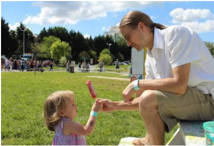
Corey Property Maintenance