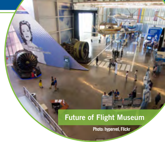
Future of Flight Museum

One of Seattle's favorite aviation attractions, the Future of Flight (FF) Aviation Center is the only publicly available opportunity to tour a commercial jet assembly plant (Boeing) in North America and see them actually building the airplanes. Also visit Paul Allen's Flying Heritage Collection of WW2