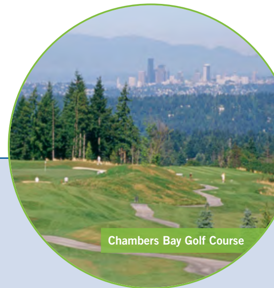
Chambers Bay Golf Course

This year in Seattle, we are teaming up with the 7th Annual Run of Hope Seattle. This local race begins a special day of events that brings together families and community to raise funds and awareness in support of pediatric brain tumor research at Seattle Children's Hospital. Our group will be listed as "Team ICMA" and will be timed separately, with awards to the top finishers. After the race, you are invited to a post-race party to celebrate. For more details, check out the race website at www.runofhopeseattle.org . $35. Ticket prices include race registration, awards, access to post-race party, transportation, and t-shirt.