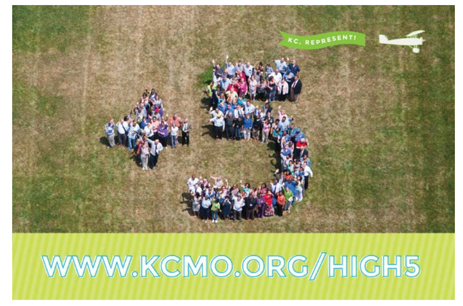
City employees formed a "+5" in recognition of gains that the city made with citizen satisfaction. Photo taken from the roof of City Hall. (July 2013)

campaign was planned titled "High Five" to celebrate the 5 percent improvement in