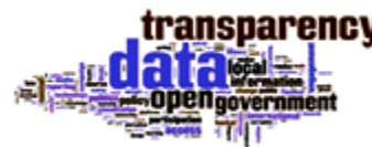
Austin Data Portal

The Austin Open Data Portal ( https://data.austintexas.gov/ ) is designed to provide high value city data to users interested in finding out more about their city, researching specific topics or using data to develop software applications. The data found here is designed to be accessible, usable and customizable based on your needs. Examples of the information that can be found here include restaurant inspection scores , Municipal Court caseload information , crime statistics , animal center statistics , and water quality sampling data .