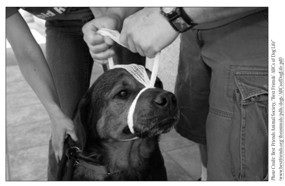
Gauze can serve as a makeshift muzzle for an injured dog.