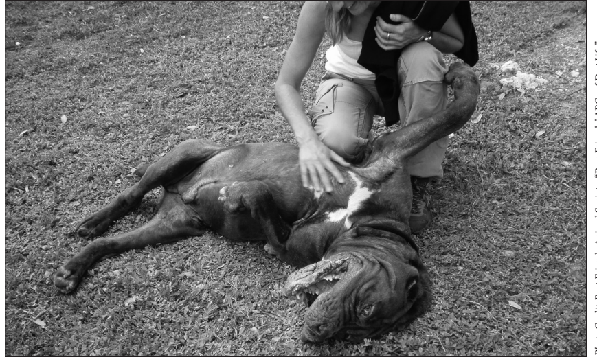
This dog's posture clearly says, "I'd like to be friends."