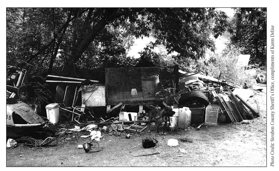
When gathering evidence, photos should be taken of the dog or dogs in the environment in which they were kept.

Physical evidence is especially important in the following cases: