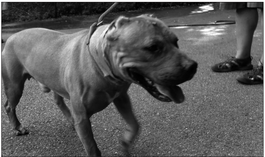
Remo, a dog from a dog-fighting bust, <del>on the way to lifetime care</del> after two years' holding at Chicago Animal Care & Control. Remo's posture says, "I'm relaxed and happy." An officer may let such a dog approach.