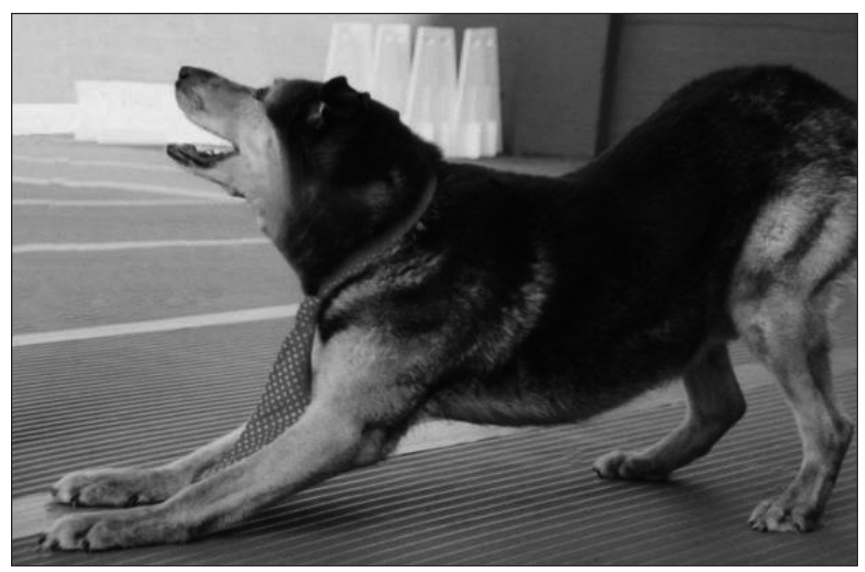
This dog's posture says, "I'd like to play." An officer may approach walking normally.

Dogs respond to us by communicating through their own body postures, facial expressions, and vocalizations. Without staring at it, the officer should look at the entire dog, checking both for behaviors that show the dog is uncomfortable and feeling threatened and for behaviors that signal comfort and friendliness. An officer should look quickly at the whole dog to get an overall impression of the dog's state of mind. Staring at the dog's face should be avoided, as this can create an eye-contact challenge.