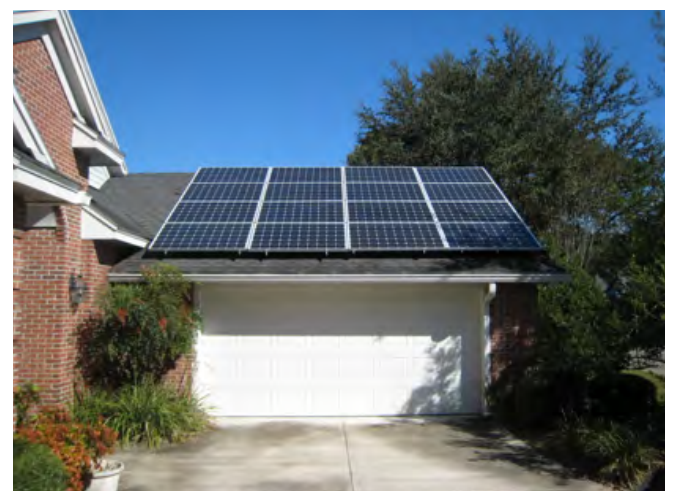
A residential 15-kilowatt solar installation using both net metering and feed-in tariff. (The two systems are not connected.)

Gainesville has been pursuing the advancement of solar technologies for more than a decade. In 2003, when the city and GRU first recognized the need to diversify and expand the community's long-term energy supply, the