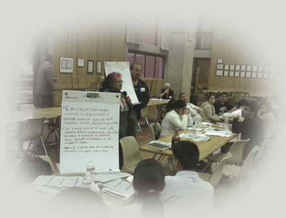
A Budget Forum at Hartnell Community College in Salinas

In the second phase of the public engagement process, community members were invited to deliberate on budget balancing options in three public forums. Nearly 200 community members worked together in small