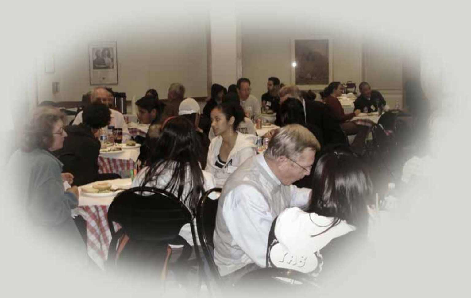
Residents discuss the budget and enjoy a meal at a Redwood City Workshop, OR Redwood City Budget Workshop

The former city budget director feels the dialogues yielded useful information for agency officials, but cautions that high-quality deliberative civic engagement is expensive and takes more time to do effectively. 18 The use of public engagement has to be integrated early enough into the budgeting process to be useful to policy makers and worthwhile to the public.