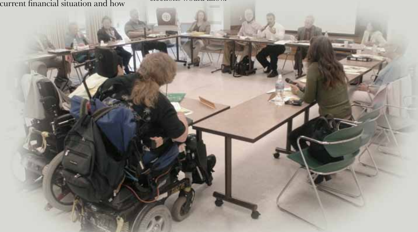
Community Forum in San Mateo County

Committee members are typically recruited, formally or informally, through political and social networks. Elected officials typically appoint or invite committee members. When the committee is composed of representatives of groups and organizations, the committee members can serve as conduits for information between the group and the local agency.