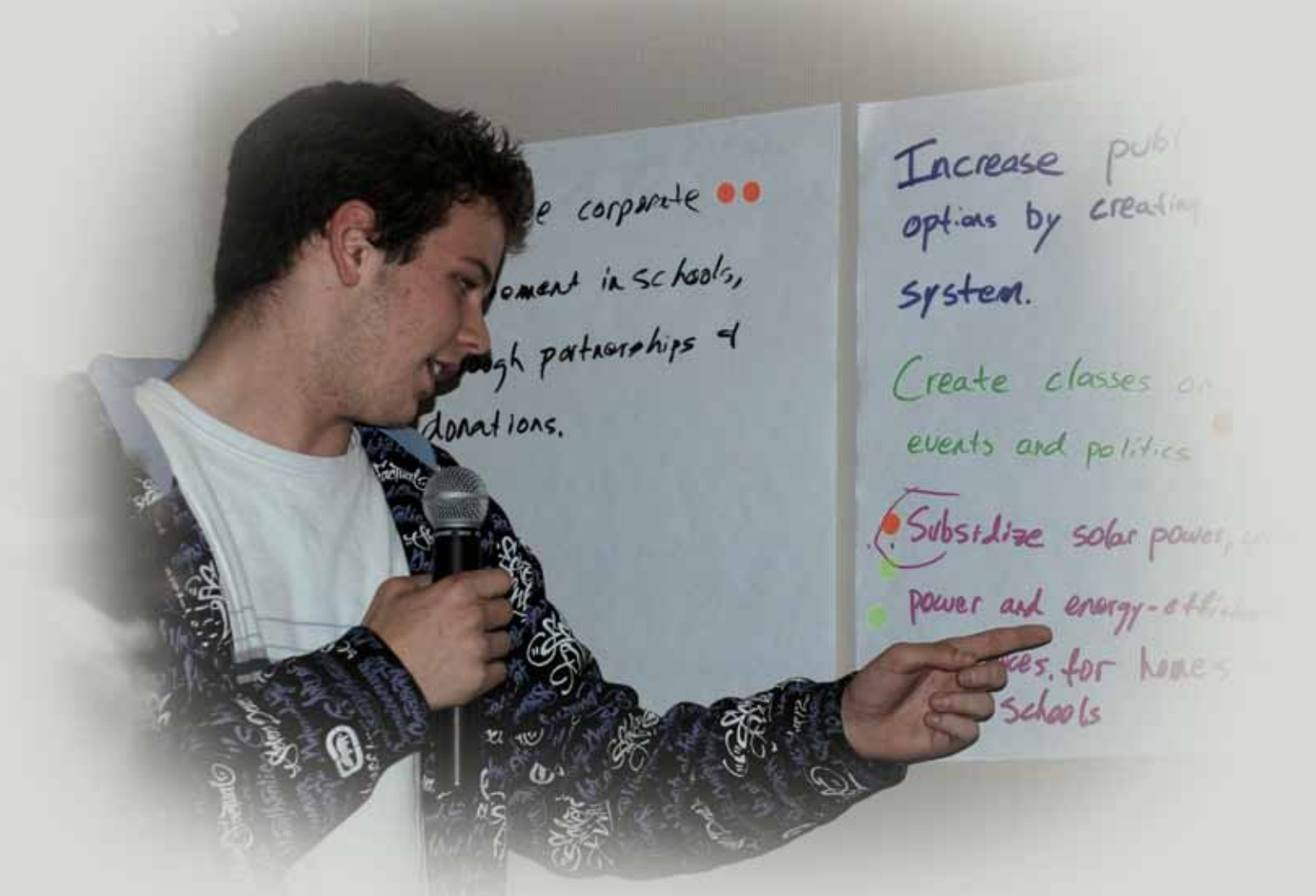
Participants at a San Mateo County Youth Visioning Forum

The committee presented its report to the city council in April 2009 and recommended that a measure to approve a half-cent sales tax increase subject to a four year sunset provision should be placed on the ballot. The mayor of Ventura commented that, “this intense, three-month budgeting exercise that