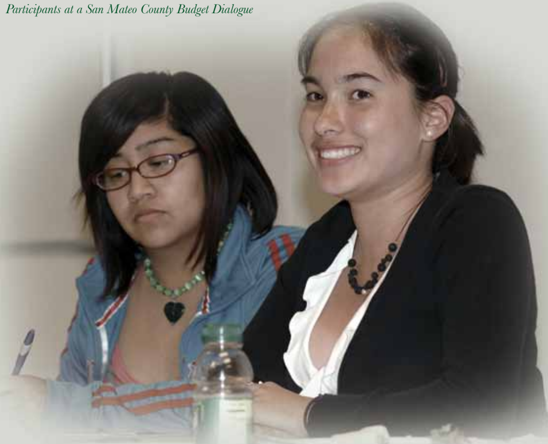
Participants at a San Mateo County Budget Dialogue

Survey methodology affects the validity and usefulness of the results. For example, online surveys only reach a certain segment of the community (those that own and use computers and have access to Internet service).