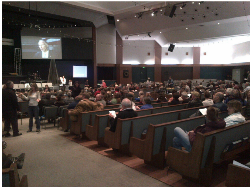
Residents of Lyons, CO gather in December for a planning kickoff meeting.

Members of a Community Planning Assistance Team (CPAT) from the American Planning Association visited Lyons, CO in January to make initial plans for an assistance project. CPAT teams assist four or five communities around the country every year. Teams consist of a leader and a small team of subject matter experts who visit a town, meet with leaders, conduct community meetings, and assist them with a targeted issue. In the case