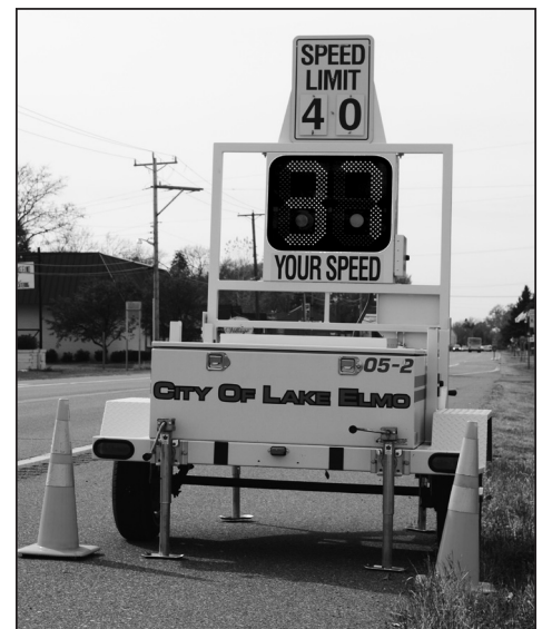
Last year's "zero tolerance" traffic enforcement policy has had a positive impact on speed violations.

One final public safety reminder is that all dogs need to be licensed through Lake Elmo City Hall. Licenses are valid for one calendar year; 2014 dog licenses will be available in November. To report a dog-at-large or any other safety concern, please call the Washington County dispatch at 651-439-9381.