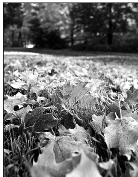
Dispose of leaves properly this fall to protect local lakes and rivers.

Left in the street, leaves can clog storm drains and cause your street to flood. The leaves also contribute