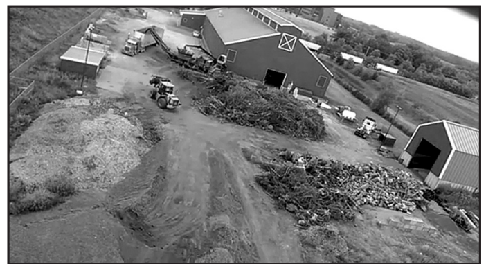
In late August, storm debris was ground into chips at both county and city collection sites. Pictured above is a screen shot from a stop motion video of the chipping occurring at the Public Works facility on Ideal Ave.

Between the two sites, it is estimated that more than 6,000 cubic yards were collected and chipped.