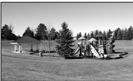
The Lake Elmo Park Commission is deciding how best to improve City parks and plan for growth. Pictured above is Carriage Station Park.

Armed with a recently completed survey and more than $900,000 of funds to allocate toward City parks and trails, the Lake Elmo Park Commission held its first annual retreat on September 28th to begin planning for the future.