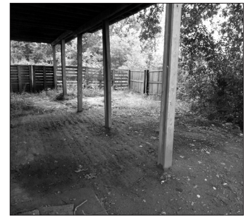
Pictured at left, a Lake Elmo property prior to the adoption of the International Property Maintenance Code. Pictured above, a cleaner view of the same property, after an administrative citation was issued. The entire process took approximately three weeks.

non-compliant have been cleaned up. This includes the property at 9447 Stillwater Boulevard that has been reported for its rundown state numerous times since 2009. Over the course of one month, after the adoption of the new maintenance code, enough trash to fill 14 30-foot dumpsters has been removed from the site. Currently there are 14 active code enforcement cases in the City.