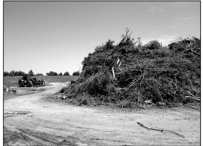
A collection site was created on the northern grounds of the Lake Elmo Park Reserve to temporarily store brush, branches, and stumps that resulted from early summer storm damage.

The City of Lake Elmo and Washington County joined forces this summer to manage extensive tree and property damage that were the result of heavy storms in June and July. City clean-up crews spent more than seven weeks picking up brush from city neighborhoods.