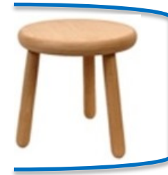
Original 3-legged stool

CCC, Chamber of Commerce, RCTTC all in same suite