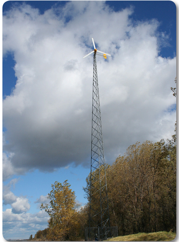
A 10 kW, 140 ft. freestanding lattice tower at a state park.

For more technical information on tower height, sound, productivity and other topics, visit www.distributedwind.org Under the Zoning Resource Center, click on Fact Sheets.