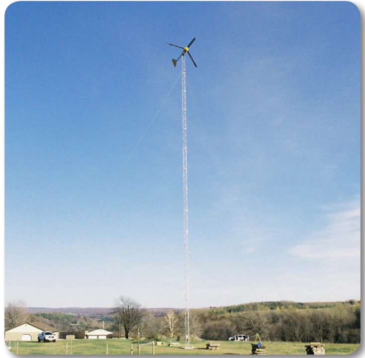
A residential 10 kW turbine on 140-foot freestanding lattice tower.

Some zoning rules limit turbines and/or their heights to a corresponding property size, such as limiting lot size to one acre or larger. Because lot sizes vary by area due to shape, requiring minimum lot sizes may essentially limit particular zones from developing wind projects.