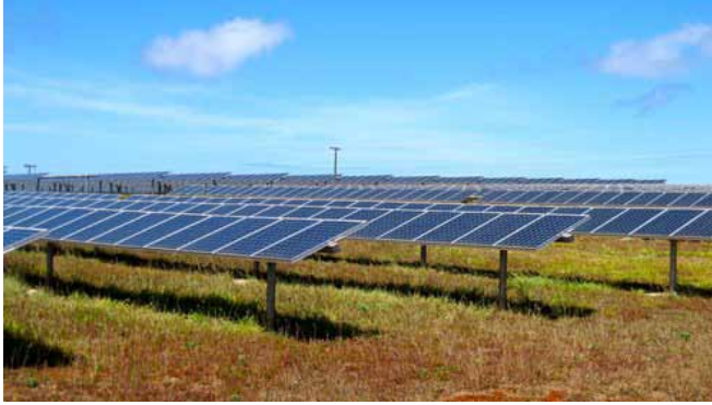
Primary-use solar farms, often large in scale, should be regulated to mitigate potential impacts.

When solar energy systems constitute a primary land use, most or all of the electricity produced is consumed off site. A major difference between these solar farms and small-scale, accessory systems is the amount of land that they occupy. As noted, most accessory use systems are placed on rooftops or limited by lot coverage or setback requirements and therefore have little to no impact on land use or consumption. In contrast, primary-use systems are ground-mounted and can range in size from less than an acre in urban settings to hundreds of acres in remote locations. This can raise concerns regarding impervious surface coverage, tree and habitat loss, transmission infrastructure, and construction impacts. Solar farm proposals can become controversial, especially when greenfields or productive agricultural lands are proposed as sites. Indeed, Santa Clara County, California, specifically prohibits commercial solar energy conversion systems on land designated for large-scale agriculture by the general plan, and allows this use on only those medium-scale agricultural lands that are deemed to be of marginal quality for farming purposes (Ord. NS-1200.331). On the other hand, a primary-use “community solar garden,” in which local residents can purchase shares to support renewable energy production as an alternative to installing their own individual systems, may be fairly small in size and a more appropriate fit within developed areas.