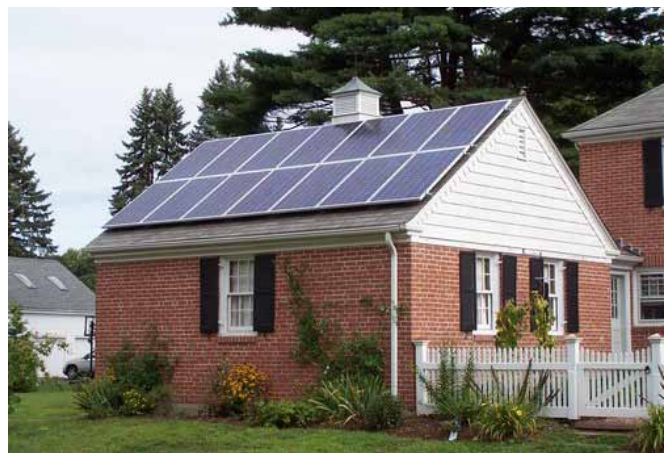
Impacts of accessory solar energy systems are typically minimal.

Communities may address accessory solar energy systems in their codes in a number of ways. Some line-list them as permitted uses in defined districts; others define solar energy systems through accessory use provisions as permitted by right in both residential and nonresidential districts, often subject to