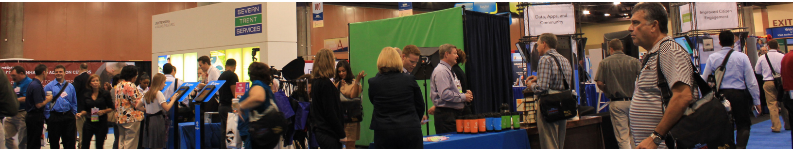
Exhibit at ICMA's 2013 Annual Conference!