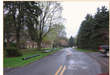
Preparations are made to extend public water lines to properties.

Thanks to the collaborative efforts of the managers and elected officials of the three townships; the executive director and