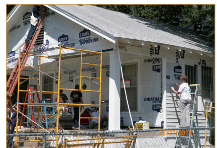
Volunteers with World Changers install siding on a Fort Smith residence.

The labor donated by World Changers in 2010 alone was estimated at $68,000. Through the generosity of partnership