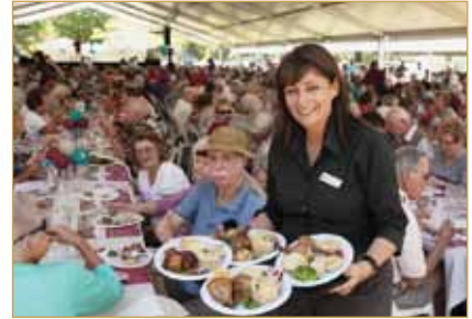
Townsville's mayor serves lunch at the annual Seniors Picnic in the Park, a free event for those over 60.

Together Townsville is a win-win for all stakeholders. The community can undertake major projects for which funding might not have been available. Beyond their own enhanced brand recognition, partners gain credibility in the community through association with council's positive