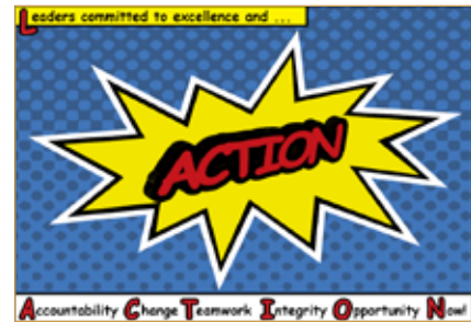
The core value brand and logo mimic the classic cartoons on the 1960s.

Over two days, more than 225 employees at all levels of the organization attended one of four rollout meetings. The 12-minute video captured images of city employees at work. Each director described how a core value is exemplified daily. Employees explained how a particular value, such as integrity, is important in their positions. Large, colorful posters and cutouts placed around the room reinforced each core value with a memorable visual display. The committee enhanced the movie theater experience by serving popcorn and power bars wrapped in the rollout brand.