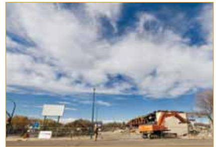
Deconstruction secures building components for reuse, recycling, or waste management.

Deconstruction projects recently completed by the city include hotels, an auto warehouse, a multifacility, and a grocery