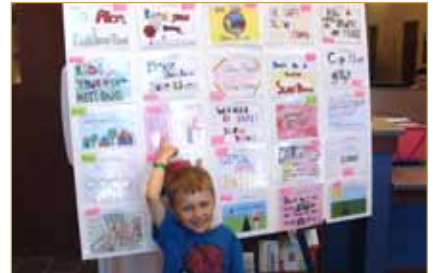
Contest entries are displayed at a local school.

Quickly the program garnered media attention. Many local schools incorporated sign design into their classroom syllabi. A local arts and crafts business held a Sign Design Night and provided supplies to children who wanted to participate. The village then spearheaded several community engagement initiatives to evaluate and judge the entries, including displays at each of the three local schools and at Village Hall, online judging, and a community gathering in the park. In the end, 115 signs were submitted, 2,412 votes were cast, and 12 entries were selected