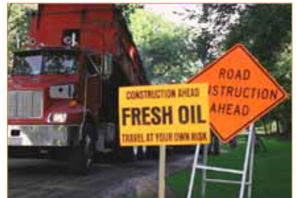
A joint roadway resurfacing project was bid via the MPI.

To date, the MPI partners have entered into 12 joint contracts, saving their taxpayers $405,500 to $545,500 and unearthing savings in their budgets that can be allocated to other projects.