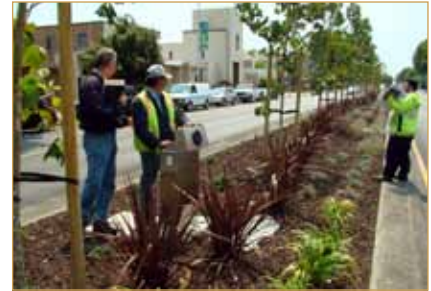
Bay-friendly medians eliminate the need to mow or use chemicals.

Since its completion in 2010, the San Pablo Avenue Streetscape Project has created a more vibrant roadway within the city and has helped El Cerrito become a distinct and identifiable place within the region.