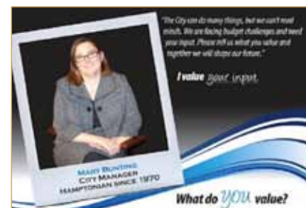
The "I Value" campaign seeks input from residents by asking, "What do you value?"

a $412.4 million budget without major controversy, and while the final budget might not have included what everyone requested, every citizen felt that his or her opinions were heard, carefully deliberated, and valued.