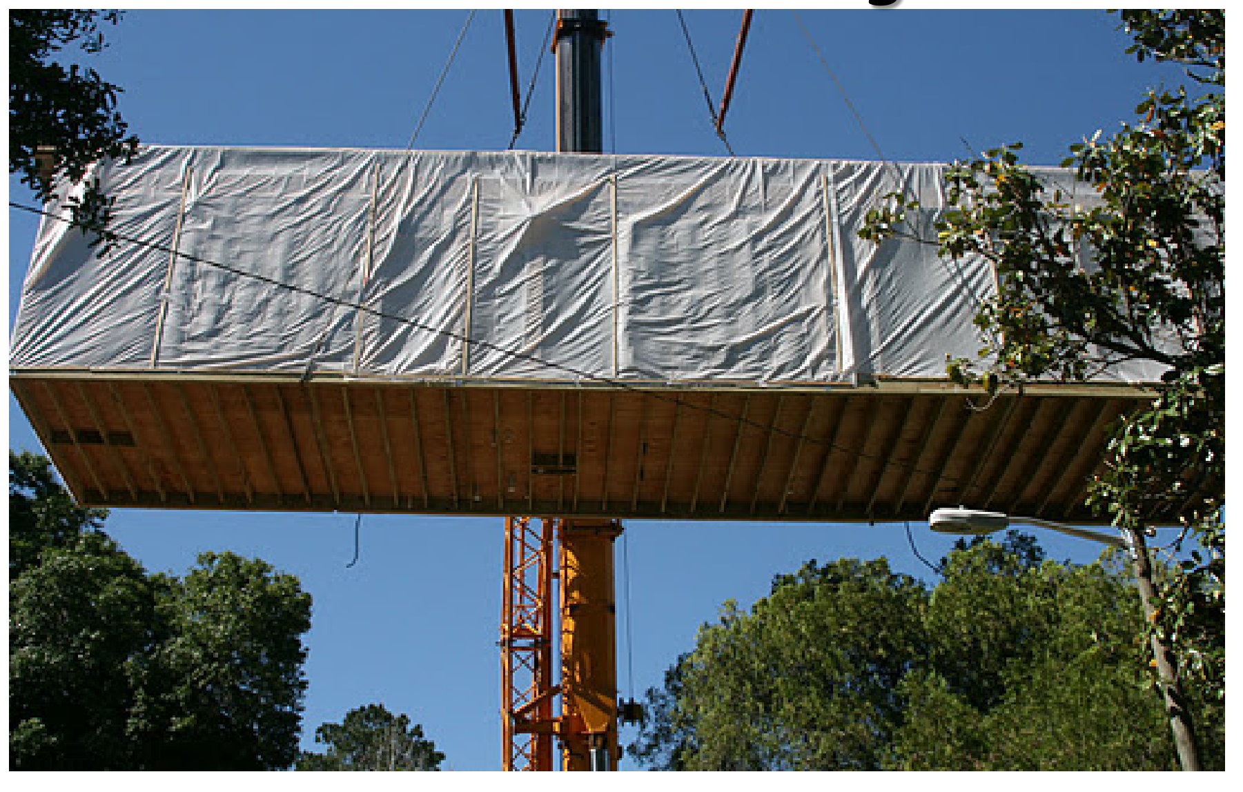
Installation of New Home on Site