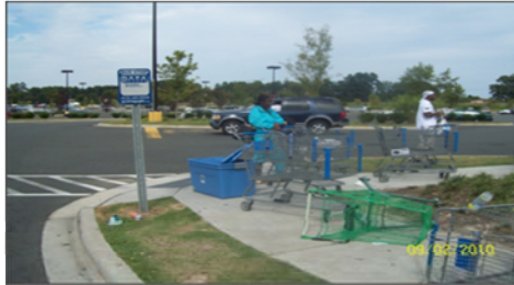
No shelters at key stops