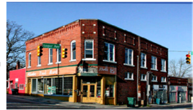
To Increase The Quality of Life For Citizens in NECD Through Employment Training, Stabilizing Tax Base, Job Creation, And Redevelopment

Liveability Principles Enhance economic competitiveness Coordinates policies and leverage investments Support existing communities