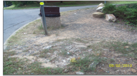
Health and safety concerns