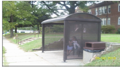
Shelters as protection from elements