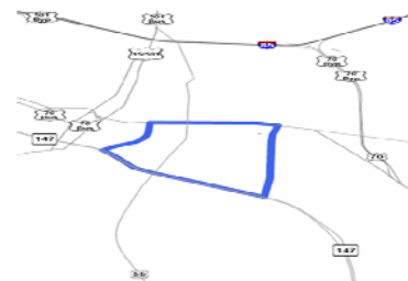
To Reflect What The Community Wants and Provide A Blueprint As To How To Get There.

Liveability Principles To provide more transportation choices To support existing communities