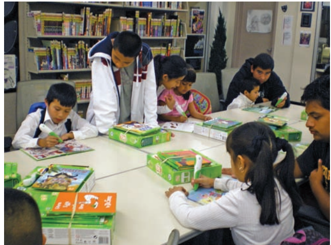
Teenagers helping young children learn math skills at the Santa Ana Public Library.

Attitude Challenges. Despite strong public support for the ideals libraries represent (e.g. access to information, equity), there can be differences of opinion about whether library services are necessities or amenities. Public libraries are often viewed by local government managers as discretionary because they are not universally associated with core needs such as public safety, health, and economic development. As local governments struggle to balance budgets during tough economic times, services such as fiction books and free DVD loans do not make compelling cases for funding by city and county managers. Ironically, some of the “amenity” services provided by libraries attract