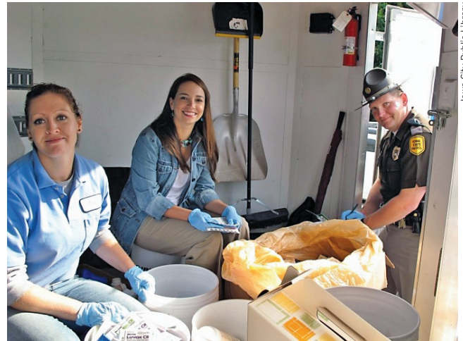
Iowa City Public Library staff members and community partners conduct their first of two expired pharmaceutical collection events. This very successful event netted over 135 pounds of expired or unused pharmaceuticals.

including the library director, police chief, city attorney and facilities manager. As a result he states that he has developed a new relationship with the library director, a better understanding about the library, and a greater appreciation for the multiple talents of the members of his team.