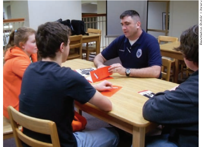
Pendleton's Wired for Safety Project helped police officers engage teenagers in discussions about public safety at the library.

Buena Vista, Virginia also had a vision of using the library for economic development. In this case, the goal was to improve the relatively low wage structure in this economically challenged area by training unemployed and underemployed residents to staff call centers. Information literacy—introducing the use of technology to those who had not yet ventured into the world of computers for any purpose, let alone as a means to a better career—was a key component of the Buena Vista project.