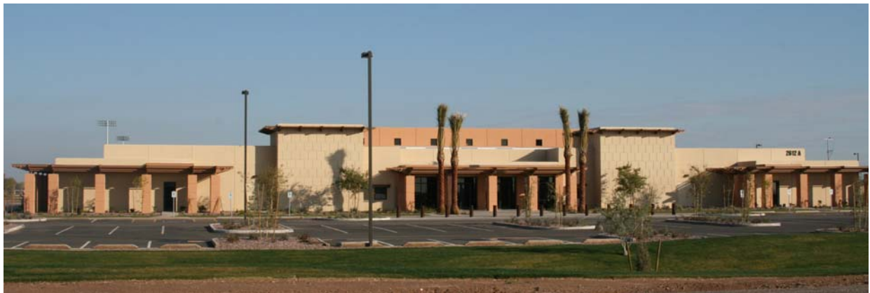
The Casa Grande Performance Institute