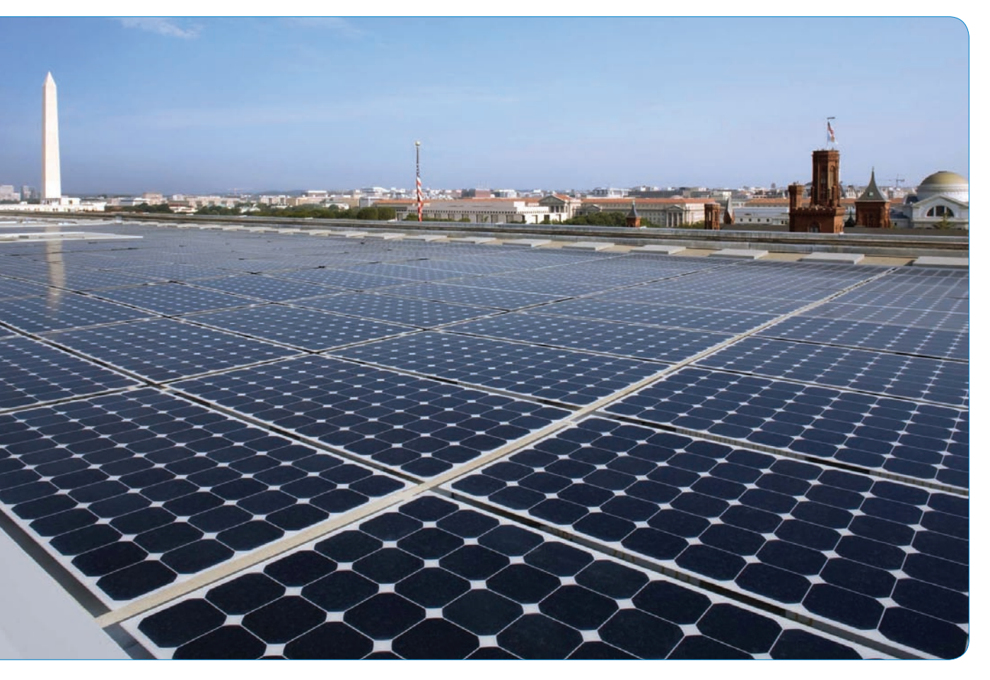
205 kW PV system installed on the U.S. Department of Energy Forrestal Building in Washington, D.C.

\textbf{Report: www.irecusa.org/fileadmin/user\_upload/ConnectDocs/IREC\_IC\_model\_Nov06.pdf}