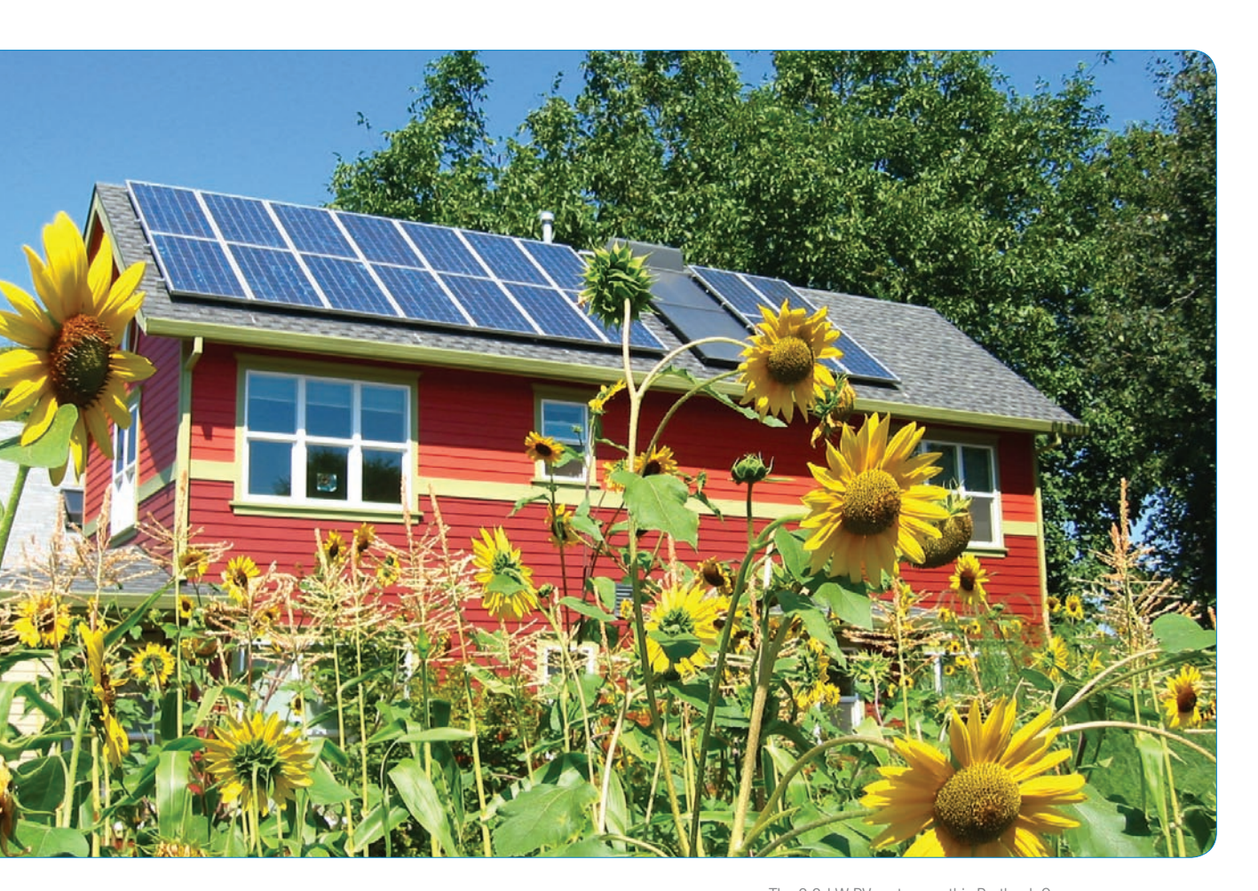
The 3.3-kW PV system on this Portland, Oregon, home soaks in the sun. The owners were able to take advantage of financial incentives offered through the Energy Trust of Oregon's solar incentive program.

The Solar America Cities activity is a partnership between DOE and a select group of 25 cities across the country. The activity and the cities are committed to accelerating the adoption of solar energy technologies at the local level. Each Solar America City has its own webpage that includes a list of project partners.