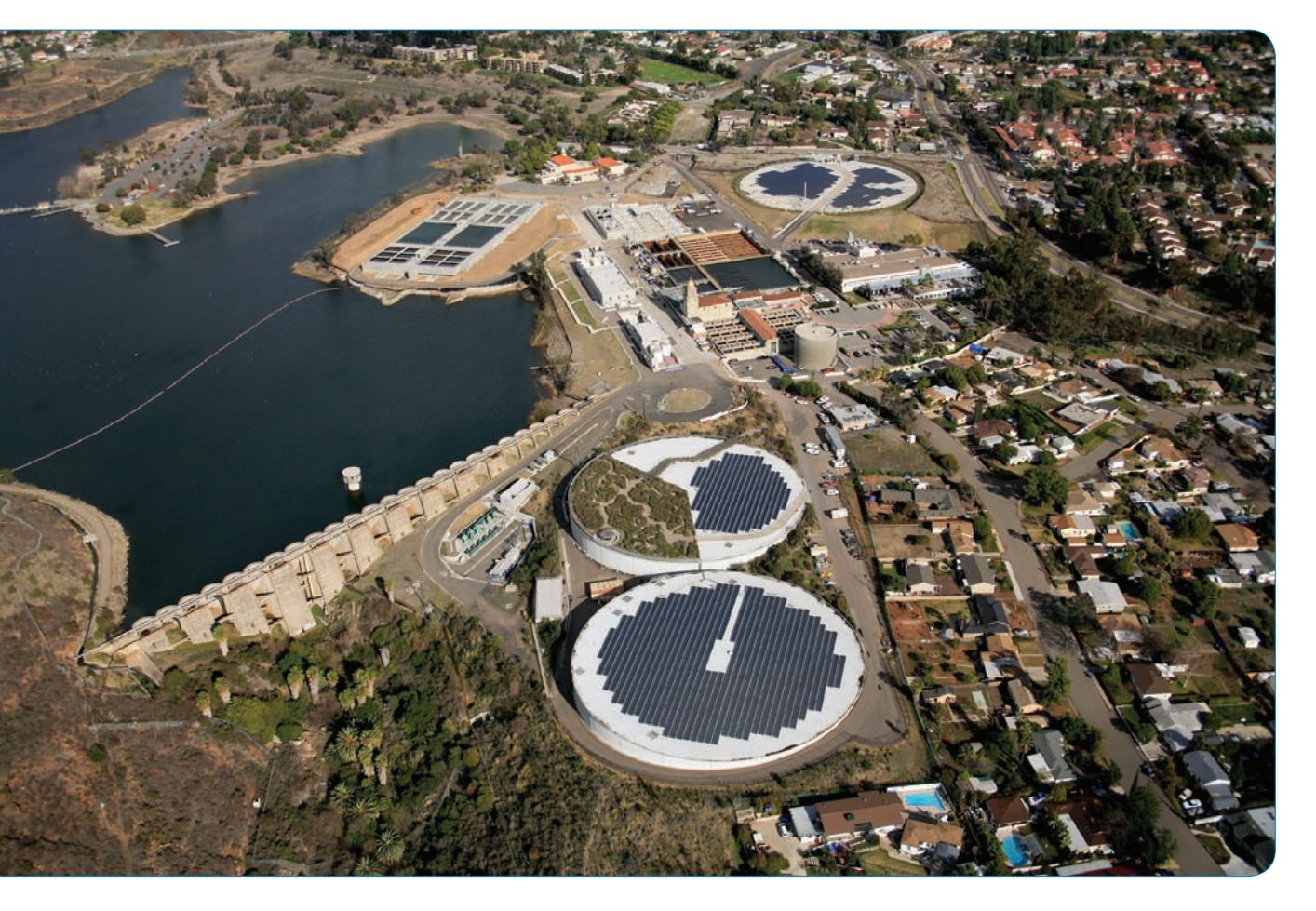
San Diego Alvarado Water Treatment Plant

Report: www.nrel.gov/docs/fy08osti/43115.pdf