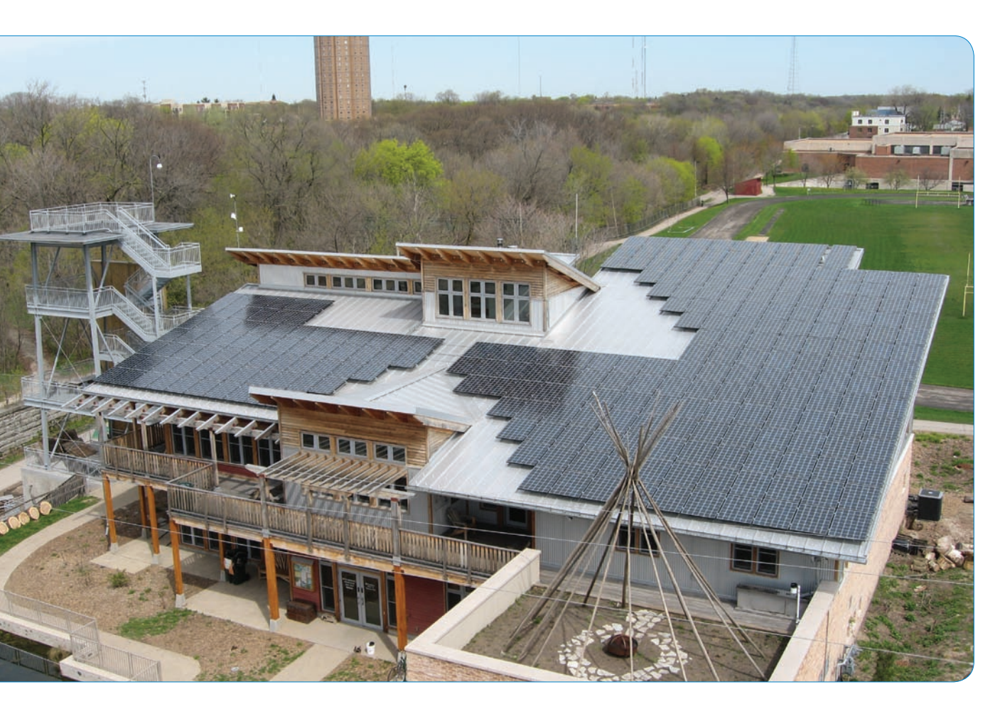
PV panels on Milwaukee, Wisconsin's Urban Ecology Center.

The catalog and map will help the city manage its solar program and serve as a public outreach tool. The catalog will help the city recognize installation trends, identify neighborhoods that are well suited for solar energy systems, and track installations to determine if a change in strategy is needed to stimulate demand to meet the city's installation goals. And the publicly available resources resulting from this work will help raise public awareness.