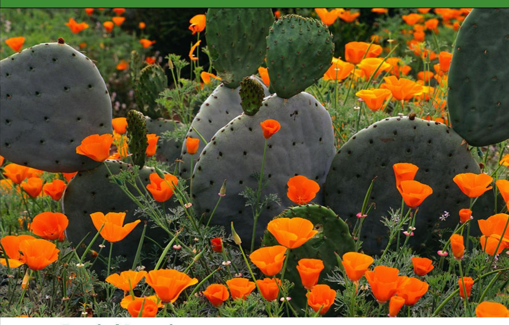
Board of Supervisors June 4, 2008