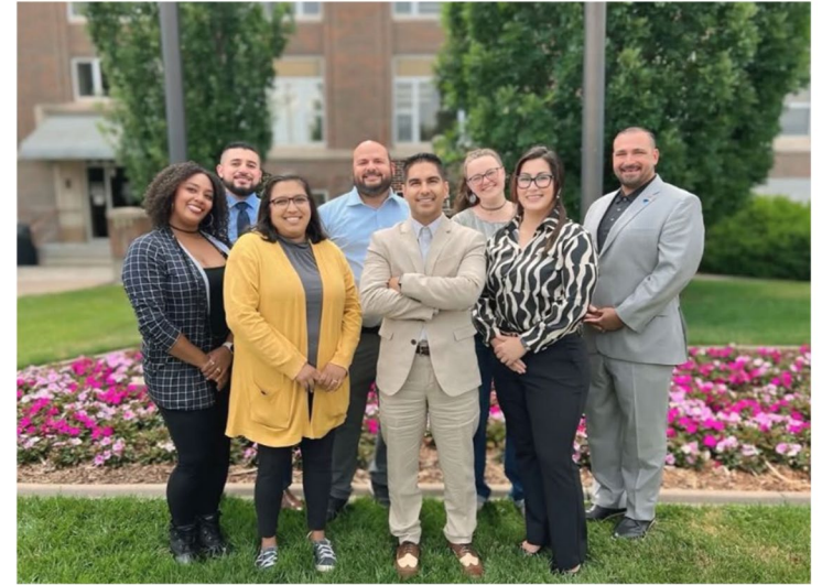
Newton, KS Community Needs and Services Assessment