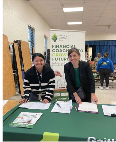
Gaithersburg, MD Financial Literacy and Empowerment Workshops