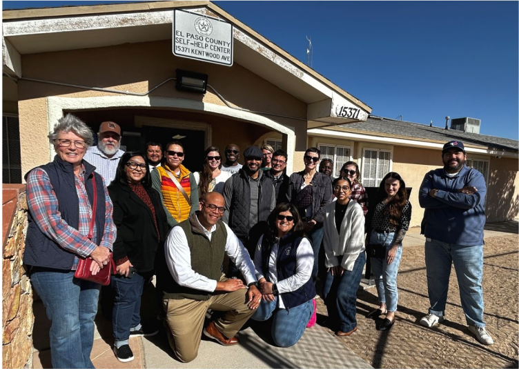
El Paso County, TX Childcare Services and Workforce Development