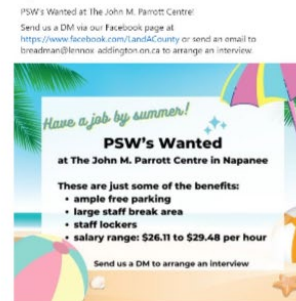
Posted May 21 and has 133 shares and one comment. This first post had 100 shares in 24 hours!

We were able to book 35 interviews. Following each interview, a PSW toured the candidate through the Home. We put out 13 job offers during that week.