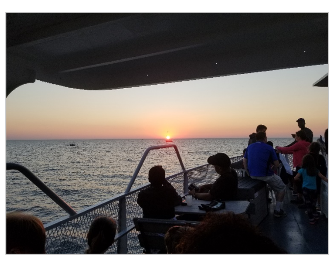
Sunset, Lake Michigan (Sept. 15, 2018)

Following the walking tour, the group had the unique opportunity to climb aboard the Aquastar Cruise Line for a beautiful sunset cruise along the shores of Muskegon Lake and Lake Michigan. This provided yet another up-close perspective on the new development along the lakeshore, including plans for a mixed-use retail/residential site on land where an old paper mill had been located. With this, the largest natural deepwater port in the region, Muskegon plans to reclaim its place as a shipping hub and point-of destination in Great Lakes tourism.