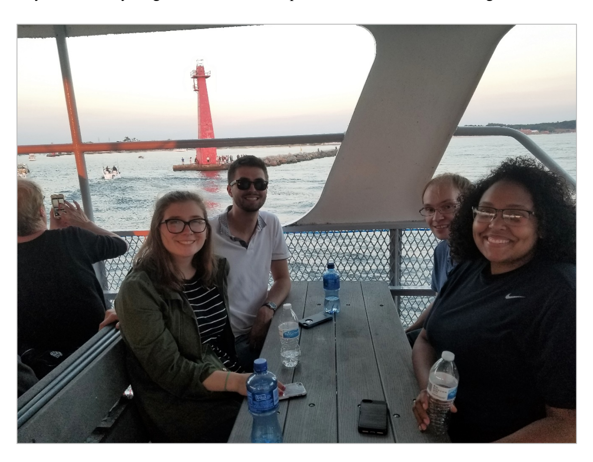
Muskegon Lake/Lake Michigan Cruise (Sept. 15, 2018)

Being on the water allowed us to experience this incredible natural resource in a very personal way. Our group members noted it as a real highlight of the event. For many, it was the first time they had done anything like this. It was the perfect blend of fun and learning!