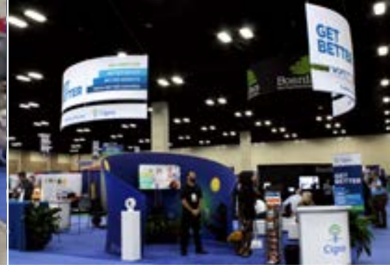
EXHIBIT AT ICMA'S 2018 ANNUAL CONFERENCE!