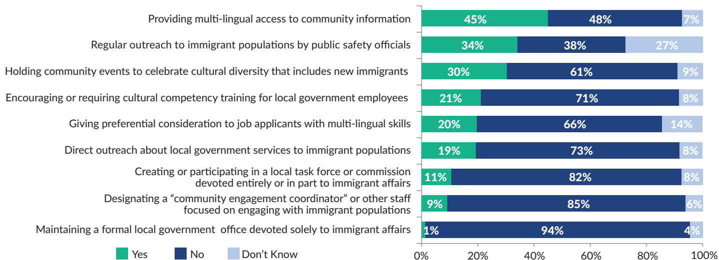
Has your local government engaged in any of the following activities?

"In the City of Rock Island, first responder/emergency services contacts with immigrant population in emergency situations, and the need for translation services, have resulted in cultural competency training and having cards with translations in several languages that address common situations."