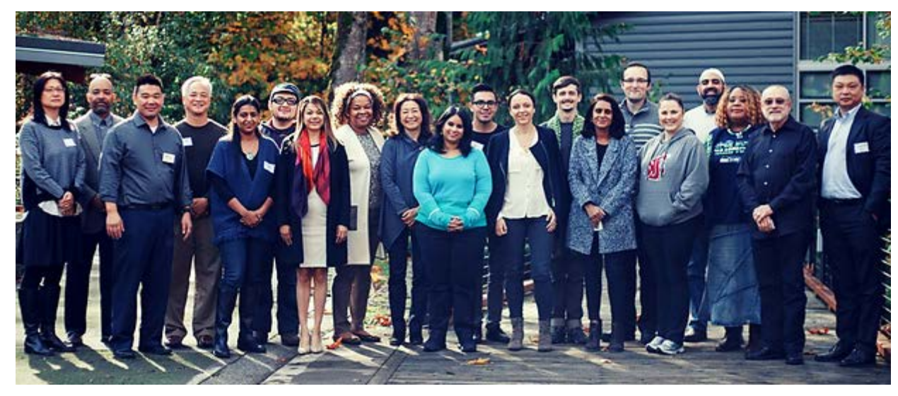
Volunteer advisory group Bellevue, Washington