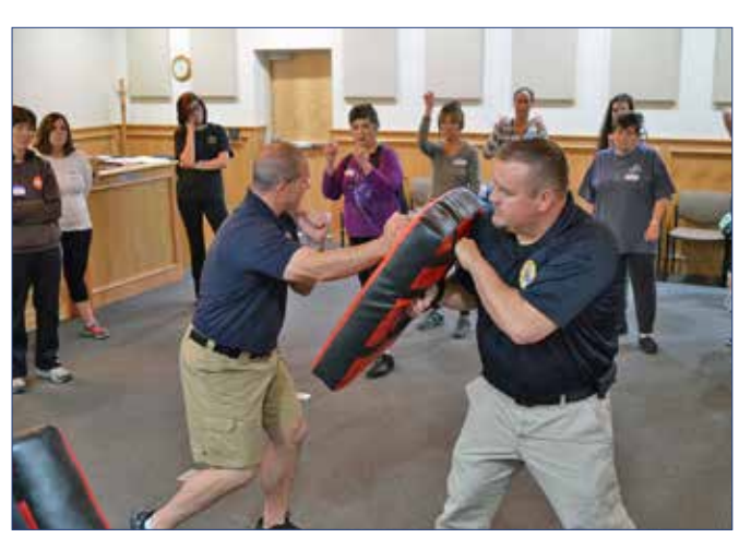
Frederick police offer women's self-defense classes.

Costs: Cost for the program is minimal, consisting largely of the officers' time and staff time to handle logistics. All told, expenses total $625 per class.