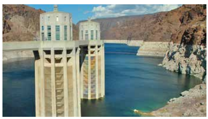
Ensuring water resource sustainability and resiliency for desert cities.

During the first two years of the partnership, Phoenix stored 4,850 acre-feet of water, which is enough to serve approximately 12,125 households for a year. In 2017, Phoenix and Tucson are expanding the agreement and Phoenix will store 36,500 acre-feet. By using Tucson's existing well capacity, Phoenix avoids the cost of developing additional wells, estimated at about $6 million each. Because Tucson relies on its aquifers as a drinking water source, storing Phoenix's water keeps its aquifer resilient and sustainable for years to come.