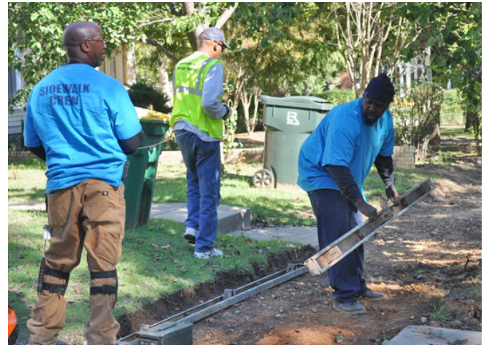
Helping ex-offenders build new skills.