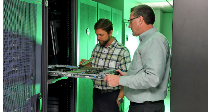
Program eliminates ransomware infections and reduces liability costs.