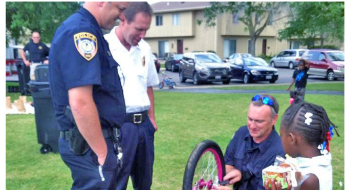
Free summer camp improves health and wellness of families.