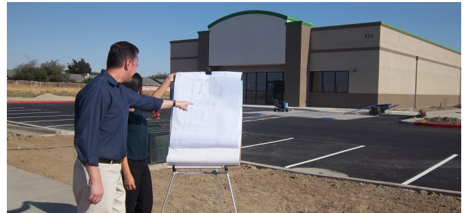
Ordinance diversifies economy, provides business growth, and reduces unemployment.

provide comments to the applicant within seven working days.