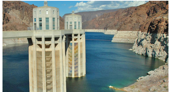
Ensuring water resource sustainability and resiliency for desert cities.

During the first two years of the partnership, Phoenix stored 4,850 acre-feet of water, which is enough to serve approximately 12,125 households for a year. In 2017, Phoenix and Tucson are expanding the agreement and Phoenix will store 36,500 acre-feet. By using Tucson’s existing well capacity, Phoenix avoids the cost of developing additional wells, estimated at about $6 million each. Because Tucson relies on its aquifers as a drinking water source, storing Phoenix’s water keeps its aquifer resilient and sustainable for years to come.