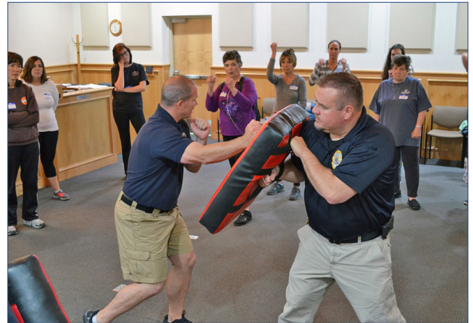
Frederick police offer women's self-defense classes.

Costs: Cost for the program is minimal, consisting largely of the officers' time and staff time to handle logistics. All told, expenses total $625 per class.