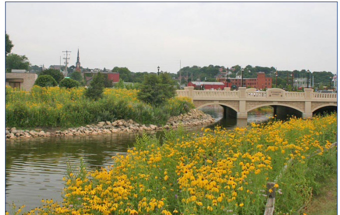
A sustainable approach to flood mitigation.

Program Implementation: The project catalyzes community economic, social, and environmental capital to create resilient neighborhoods, foster economic opportunities, and balance resources. The BBWFMP created an open waterway and floodplain designed to carry storm water through Dubuque's north end without flooding adjacent properties. It also serves as a linear parkway connecting Dubuque's historic riverfront and urban core. The parkway features a hike/bike trail, rain gardens/bioswales, pervious pavement, an amphitheater, and more than 1,000 trees and other plantings.