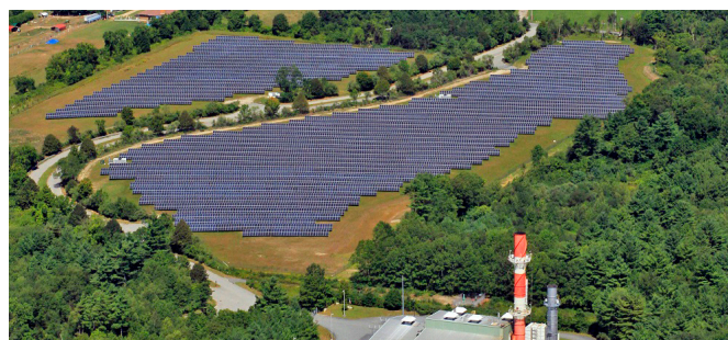
Partnership ensures affordable electric prices.

Costs: Most of the cost comprised staff time. The only direct costs were for the municipal legal counsels who reviewed the energy supply contract, totaling less than $20,000.