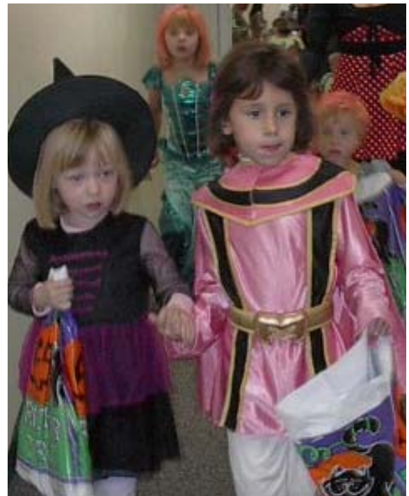
Magic Tree House Preschoolers Trick or Treat at City Hall