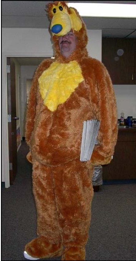
Purchasing Dan Marran - Smarter than the average Bear