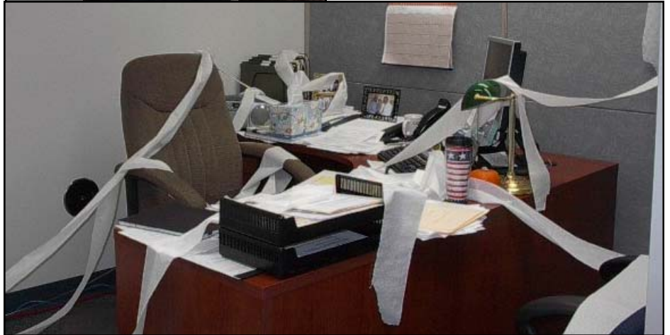
When the Mouse was away, the Cats were at play!