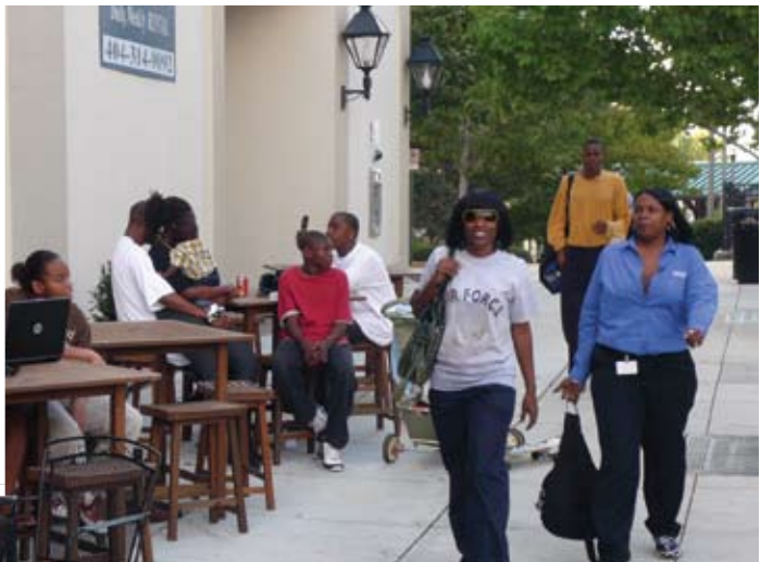
The sidewalks of downtown Decatur bustle with outdoor dining and shopping.