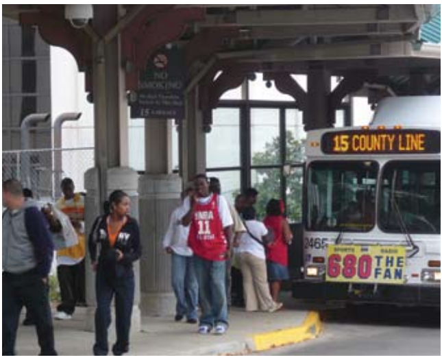
Decatur has invested heavily to ensure easy pedestrian access and transit connections for residents who rely on the MARTA subway system and buses.

Among the proposals that were received in the spring of 2006, one stood out. The Georgia Institute of Technology Center for Quality Growth and Regional Development had partnered with Sycamore Consulting, Inc. and Kimley-Horn and Associates, Inc. to propose a plan that put Decatur's goals front and center. 4 City commissioners agreed to spend $450,000 to develop the plan, initiating the largest service contract in the city's history for a proposal that pointedly addressed the city's strategic goals.