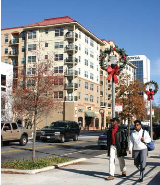
Decatur's wide sidewalks are just one feature of downtown streetscapes that encourage visitors and residents to get around on foot.

Floyd described as “the heart of our community.” In Georgia, whose 37 percent of overweight children in 2009 was the third highest in the nation, 7 the effort to encourage more kids to walk or bicycle to school has taken on great urgency. In Decatur, with the CDC in Atlanta at the city’s doorstep, local leaders have become keenly aware of the serious health challenges associated with childhood obesity, including high blood pressure and rising rates of type 2 diabetes, which had once occurred almost exclusively in adults. For this reason, Decatur’s SRTS program, one of the most successful in the state, is administered by the city’s active living division.