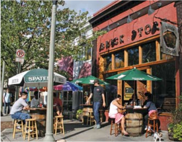
The Brick Store pub, one of several independent restaurants and retailers to open in the 1990s, has become a popular draw in downtown Decatur.