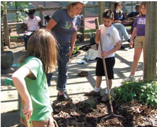
Decatur’s Scott Garden, located behind the recreation center, is popular with all ages. The city is moving quickly to develop other community gardens.

This garden, along with the two smaller new gardens, will help the city advance a number of goals: make it easier for residents to get affordable, healthy food; increase Decatur’s food security with a reliable source of locally grown produce; and preserve green space with sustainable agricultural practices that will shrink the city’s carbon footprint by reducing the distance that food travels from farm to table. “My dream,” said Mayor Floyd, “is that some day we would have a slow food festival,” with the objective of spotlighting healthy foods that are locally grown. “I don’t know how it would all work, but it’s totally community driven, and with this property available, the opportunities are just endless.”