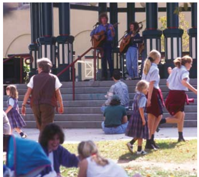
As the city started hosting live music, festivals, and other special events in its town square in the 1990s, residents flocked to the downtown.

The process ultimately involved about 500 residents and community leaders. Participants identified sixty action items touching on everything from land use and citizen participation to taxation and schools, laying the foundation for the development of the strategic plan. 2 The city then formed action teams charged with identifying and prioritizing problems and finding solutions to them. Finally, community members reviewed and commented on the goals and recommendations, which related to community character, economic planning, cultural diversity, green space, and other quality-of-life and social goals. The final product was the ten-year City of Decatur Strategic Plan 2000.