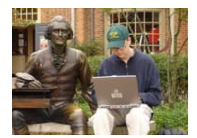
Free wi-fi service in Williamsburg's historic district brings 21st century technology and convenience to an 18th century environment.