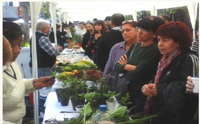
In Rosario, 250 families produce 98,000 kg of vegetables and 5,000 kg of various aromatic plants annually, 10,000 kg of which are transformed into preserves, sweets, creams, and gels.

A third study applied runoff modelling. Comparing future land use that has the maximum amount of green areas, UPAF, green streets, sidewalks, and roofs to current land use would reduce run-off by 4%. This corresponds to reduce flood risk by 0.72 times. For this future scenario, the urban drainage system would be able to cope with a rainfall intensity of 146 mm, implying that no further expansion of drainage infrastructure would be needed in the foreseen future (Zimmermann and Bracalenti, 2014).