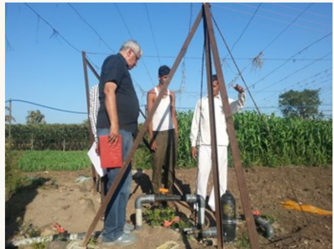
Ground water over exploitation for agricultural use in Nashik, India. @ Thakur and Kumani, 2015