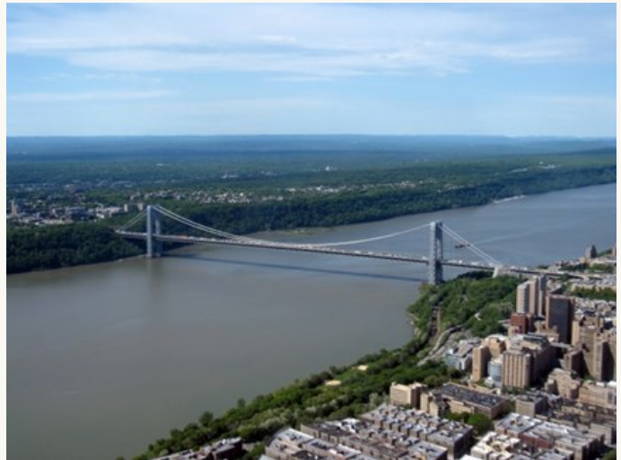
New York's food infrastructure vulnerability to climate change.

Programs like New York's can stabilize rural land use and stewardship by strengthening urban support for farmers producing environmentally-friendly food and fiber. In addition, the New York City example offers lessons about resiliency in the age of climate change.