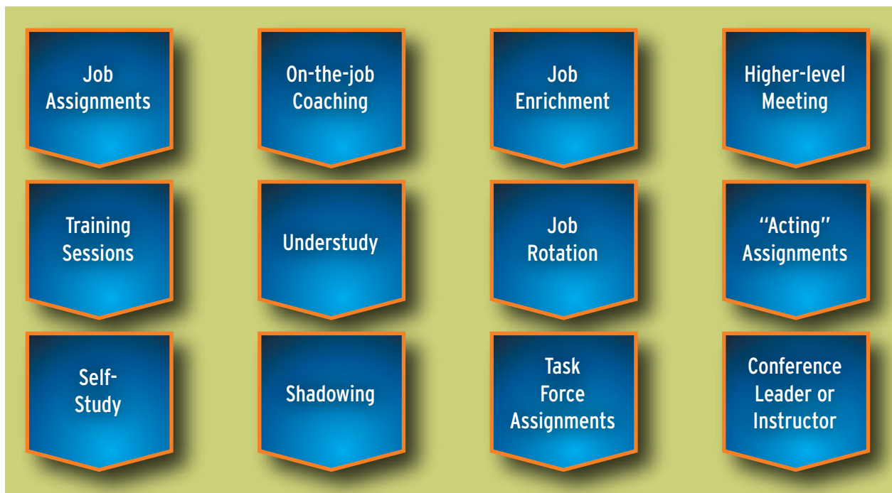
Figure 3. Employee Development Strategies